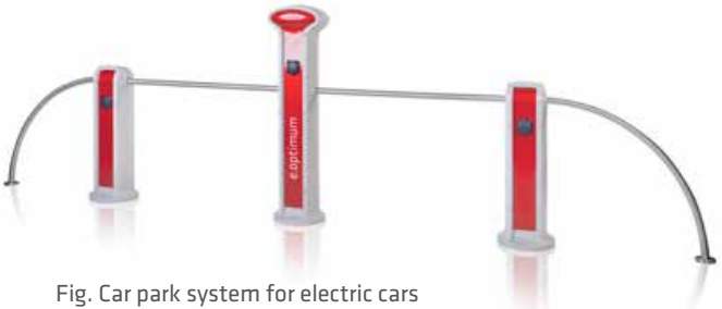
Fig. Car park system for electric cars

Ideal for larger car parks with lots of visitors, e.g. near shopping centres or popular tourist destinations.